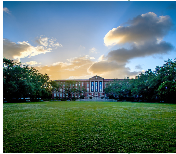
TABLE OF CONTENTS CMVSS